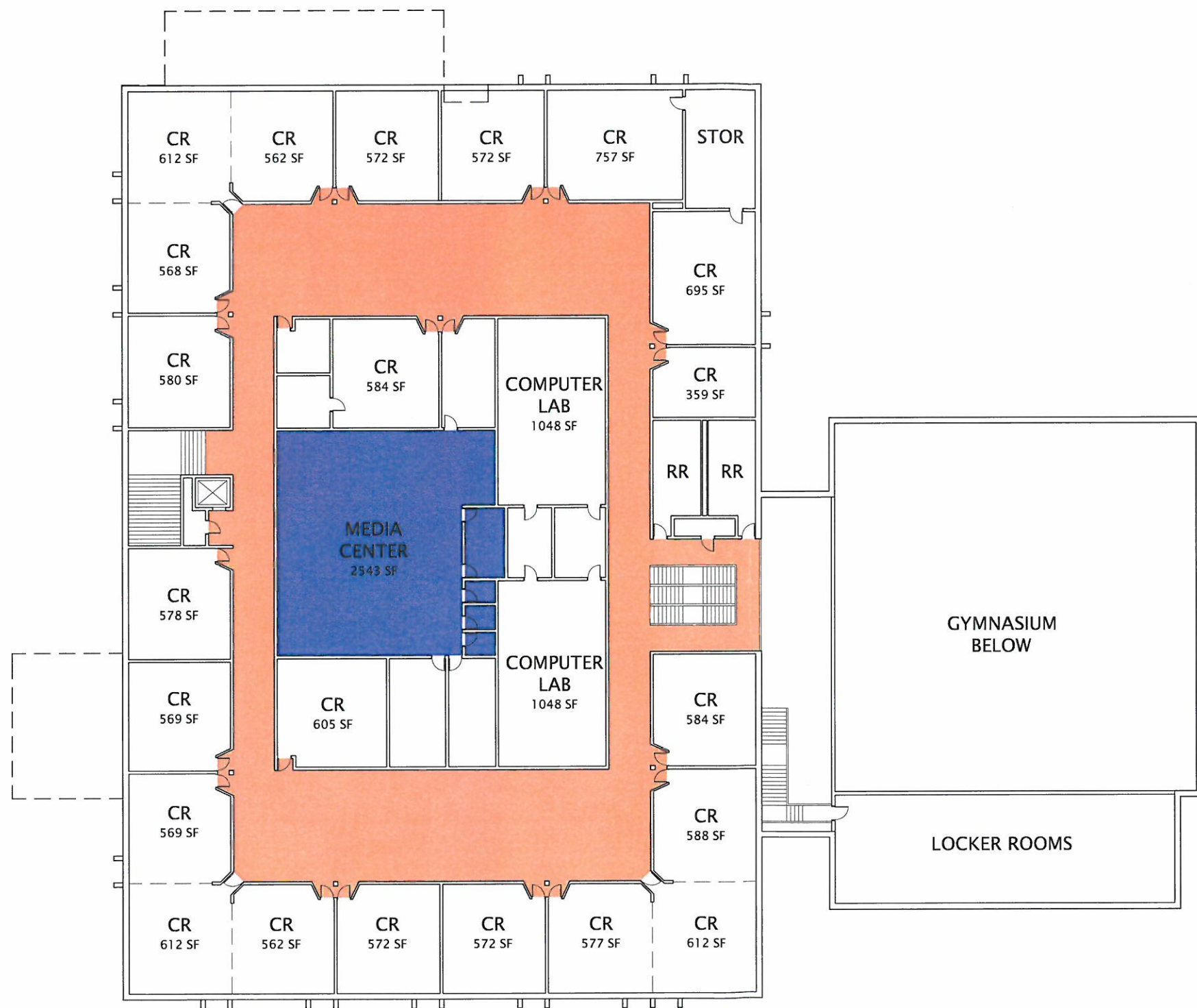
SECOND FLOOR PLAN SCALE: 1" = 30'-0"